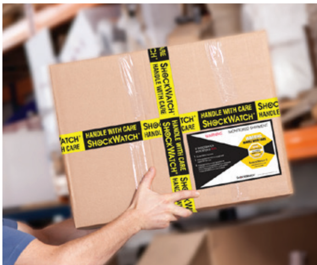
ShockWatch 2 in this photo is featured with a companion label and alert tape.

ShockWatch 2 impact indicators indicate when products have been exposed to a potentially damaging impact during transit or in storage. ShockWatch devices are tamperproof, field-armable, mechanically-activated devices that turn bright red when an impact occurs. Their presence on shipments deters mishandling and results in reduced damage related costs.